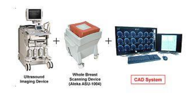
Figure 1 . An overall system for breast cancer screening using ultrasound images. The system consists of an ultrasound imaging device and a whole-breast scanning device for whole breast volumetric data acquisition. A workstation is also included for the purpose of pre-processing and analysis of the images acquired by the scanning device from the patient and as a viewer for the visualization of the images along with the CAD results [28].

Two the most often examples of CAD in clinical areas are the use of computerized systems in mammography and chest CT radiography. World wide a major killer of breast cancer. United woman is In States. approximately 41,000 women die from breast cancer and 213,000 women are diagnosed with breast cancer year [25]. Nowadays, more than each 5000 mammography CAD systems are in current use in hospital, clinics and screening centers in the U.S [26]. Mammography is widely used in breast cancer screening. It is very effective in detecting breast cancer in women over 50 years, but it is not that effective for younger woman or woman with dense breast tissues.