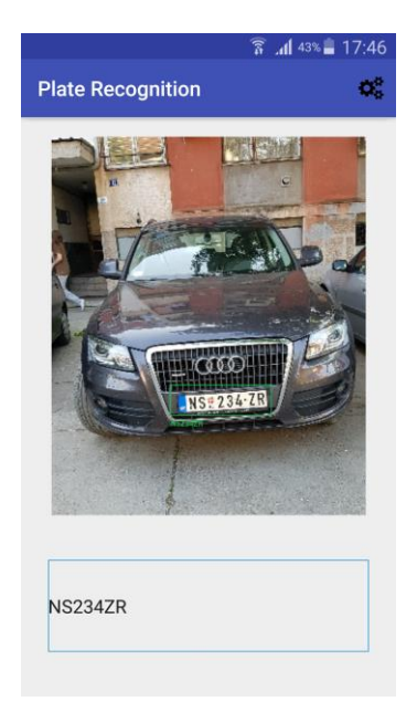
Figure 4. Mobile application

System used for testing the developed OCR component is the implementation of the general system solution mentioned at the beginning of this section. It uses Android mobile device as the client side. Image can be captured or uploaded from the gallery and sent to the server side which holds the OCR component. OCR component process the image through the CNNs which results in the plate's text which is sent as the response back to the Android. Figure 4. represents the client side application for testing the proposed system.